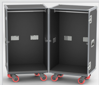
#68-343 Double Wardrobe