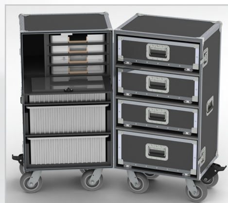
#68-610DP Double Drawer 4