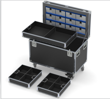
SideLinePRO-2 #68-977 Shown with optional trays #10-300 & #10-301

Our PRO-SERIES is designed to be the best of the best! These popular cases have all the "bells and whistles" that you have asked for to simplify the demands of your job. Athletic cases in our PRO-SERIES will have a variety of upgrades including drawers on glides, removable trays, 6" turf tires for easy mobility, tilt-bins, removable trays, tape spindles, lockable interior storage and more.