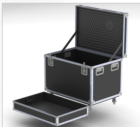
#10-142 SportLocker 2 Shown with optional tray #10-053