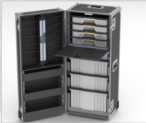
UltiMate 1 #68-428

Our PRO-SERIES is designed to be the best of the best! These popular cases have all the "bells and whistles" that you have asked for to simplify the demands of your job. Athletic cases in our PRO-SERIES will have a variety of upgrades including drawers on glides, removable trays, 6" turf tires for easy mobility, tilt-bins, removable trays, tape spindles, lockable interior storage and more.