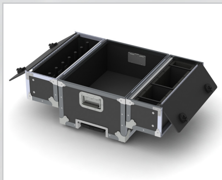
#68-639 Mini SplitTop

Our Classic-Series is a popular collection of tried and true athletic cases, used by athletic professionals in High Schools, Universities, Semi-Pro and Pro teams. They include various case sizes and interior options and are designed to simplify the demands of the game.