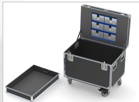
SideLinePRO-1 #68-982 Shown with optional tray #10-053