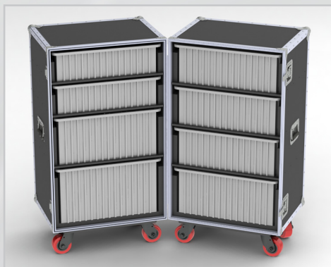
#68-609 Double Drawer 2

Our Classic-Series is a popular collection of tried and true athletic cases, used by athletic professionals in High Schools, Universities, Semi-Pro and Pro teams. They include various case sizes and interior options and are designed to simplify the demands of the game.