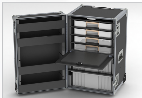
SportMate I #68-419