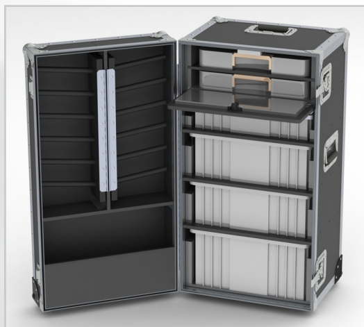
#68-807 UltiMate 2