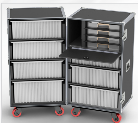
#68-610 Double Drawer 3