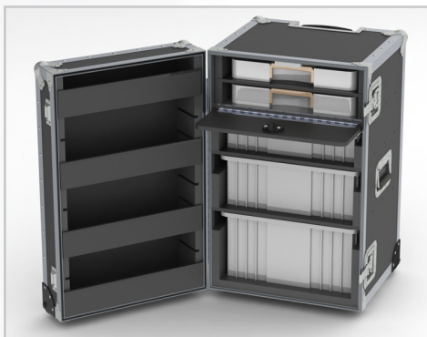
#68-806 SportMate 2

Custom athletic cases also available contact the Pros at Wilson Case