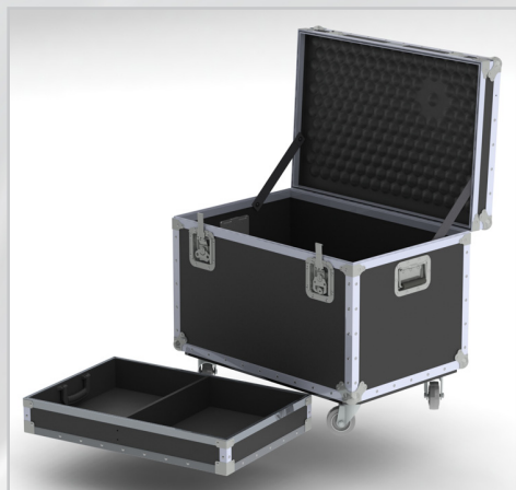
#10-122 SportLocker 1 Shown with optional tray #10-052

Our Classic-Series is a popular collection of tried and true athletic cases, used by athletic professionals in High Schools, Universities, Semi-Pro and Pro teams. They include various case sizes and interior options and are designed to simplify the demands of the game.