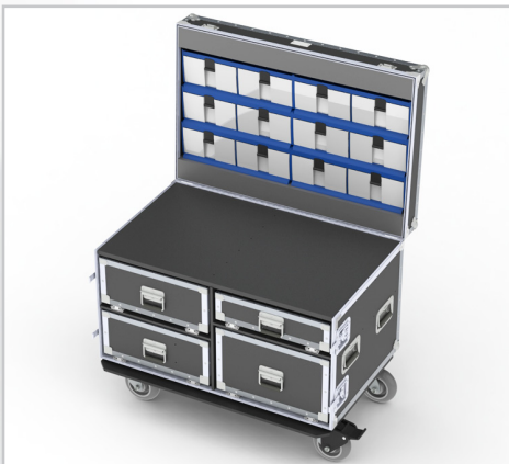
MobileMed XL #68-790