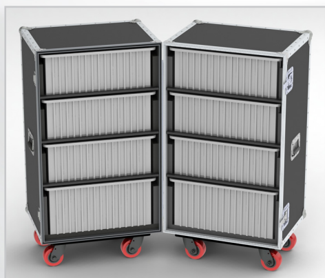
#68-611 Double Drawer 1