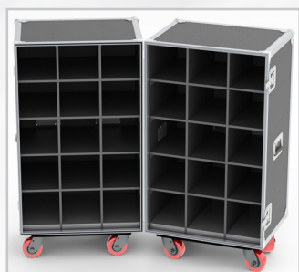
#68-345 Double Shoe